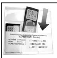
G) Return pouch

G) Place the cover of the dosimeter in one of the 3 pockets of the plastic return pouches in such a way that the film side faces inwards (as indicated on the picture).